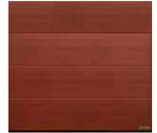
18 Rusty Oak