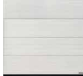
32 White Oak