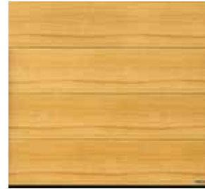
15 Nature Oak