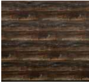
13 Burned Oak