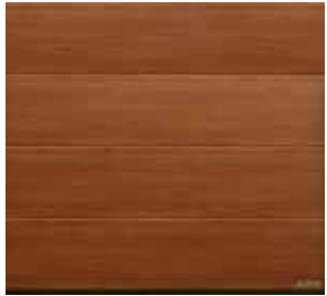
19 Noce Sorrento Balsamico