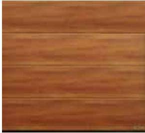
30 Colonial Walnut