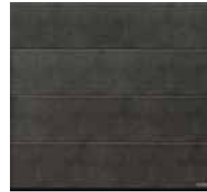
9 Grigio Scuro