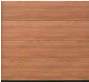
20 Noce Sorrento, plain