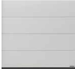
31 White Brushed