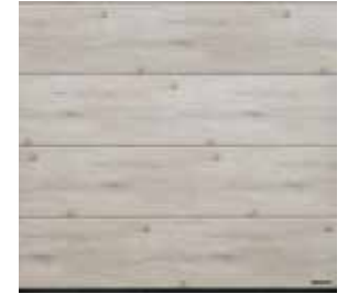
34 Whitewashed Oak