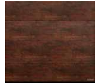
10 Rusty Steel