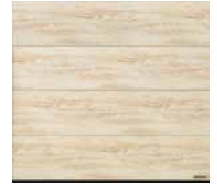
26 Weathered Look