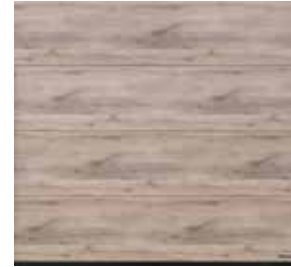
33 White Oiled Oak