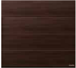
28 Terra Walnut